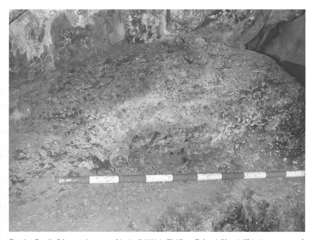
Fig. 5. Detail of the test pit excavated in April 2000 in El Alloru (Balmori, Llanes). This site was surveyed by the Count of the Vega del Sella in 1915.

In the territory that directly occupies us here (the western Cantabrian region), we have a substantial lack of data between the end of the Asturian (end of the 6th millennium cal BC) and the appearance of the first megaliths (2<sup>nd</sup> half of the 5<sup>th</sup> millennium cal BC), that is to say, we hardly have any information