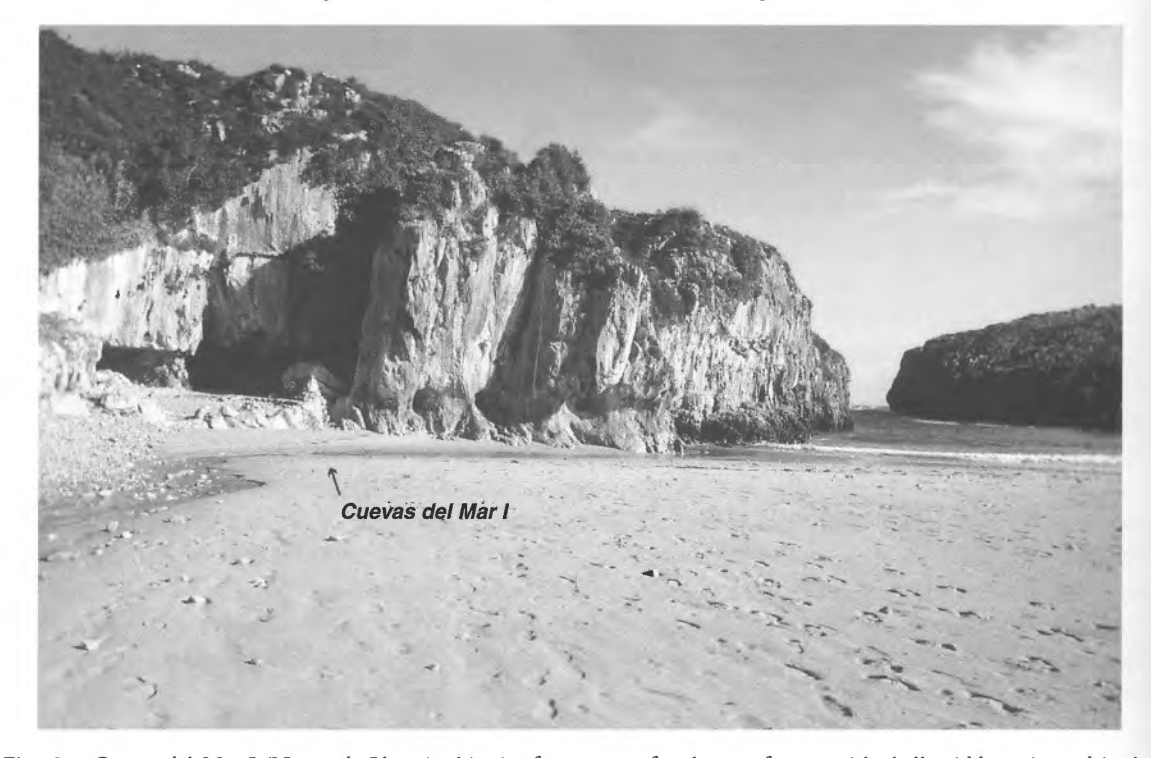
Fig. 3. Cuevas del Mar I (Nueva de Llanes): this site forms part of a cluster of caves with shell middens situated in the mouth of the Nueva River. These deposits were surveyed by the Count of the Vega del Sella in the 1920's.