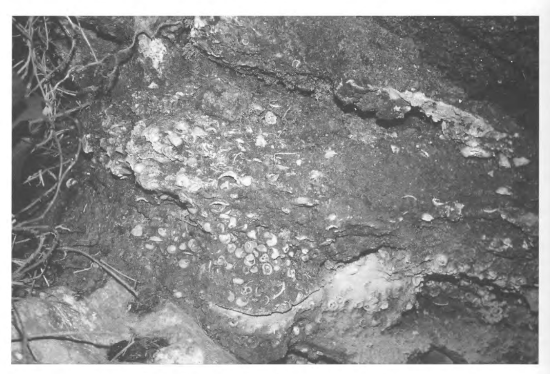
Fig. 2. Shell midden of Madalenas Cave (Vidiago, Llanes).